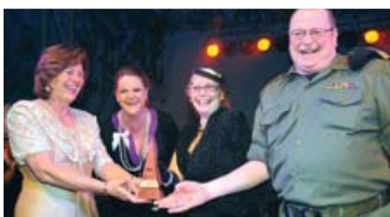
Joint winners Wesleyhaven Village Lower Hutt and Pohlen Hospital Matamata take out the IN site Overall Award.