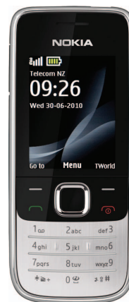
Mobile Only RRP $173.04 + GST