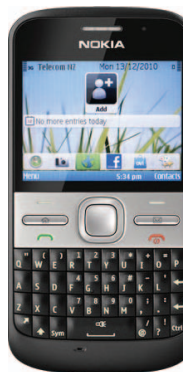
Mobile Only RRP $433.91 + GST