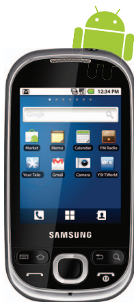
Mobile Only RRP $303.48 + GST