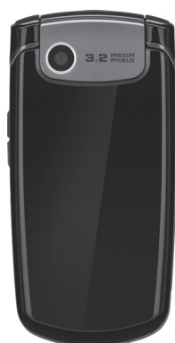
Mobile Only RRP $216.52 + GST